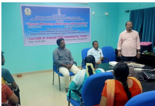
Attending Pondicherry Fisheries Dept. program