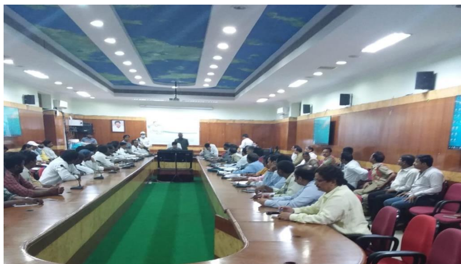
SCO attending Visakhapatnam FH High level Management committee meeting