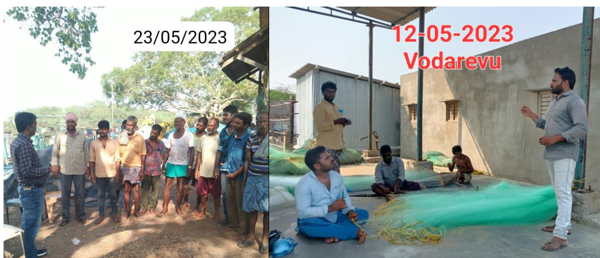
Awareness programmes conducted by HDCs