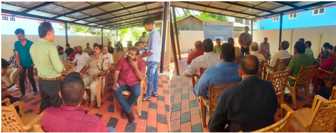
Stakeholders meetings regarding plastic project