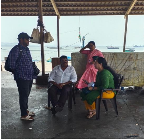
Stakeholders meeting at New ferry wharf