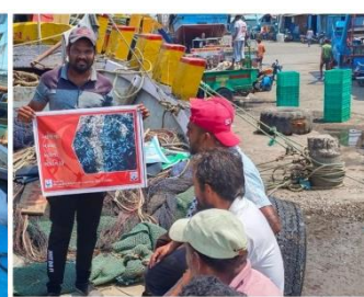
Awareness conducted by HDCs