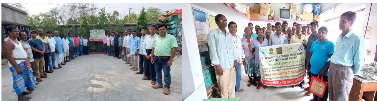
MPEDA Funded Fishing Harbour based programmes for SC fishers