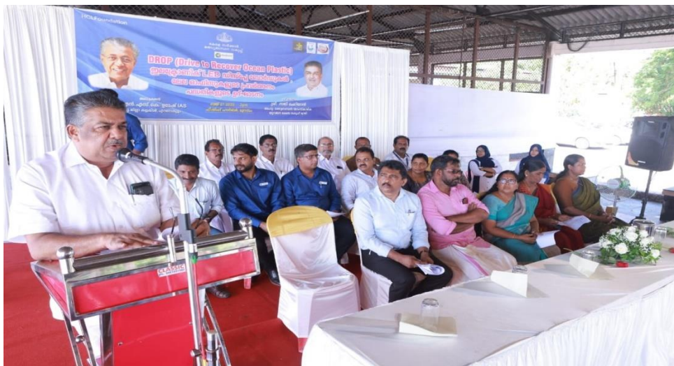
Inauguration of DROP (Drive to Remove Ocean Plastic) project at Munambam FH by Shri. Saji Cheriyan, Hon'ble Minister of Fisheries, Kerala