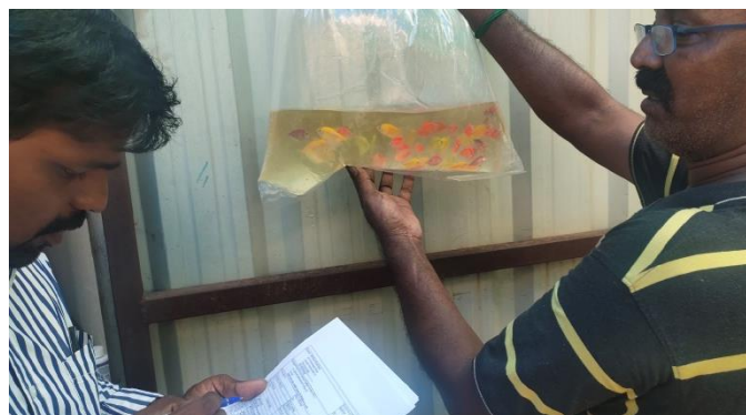
Issuing Ornamental fish health certificate