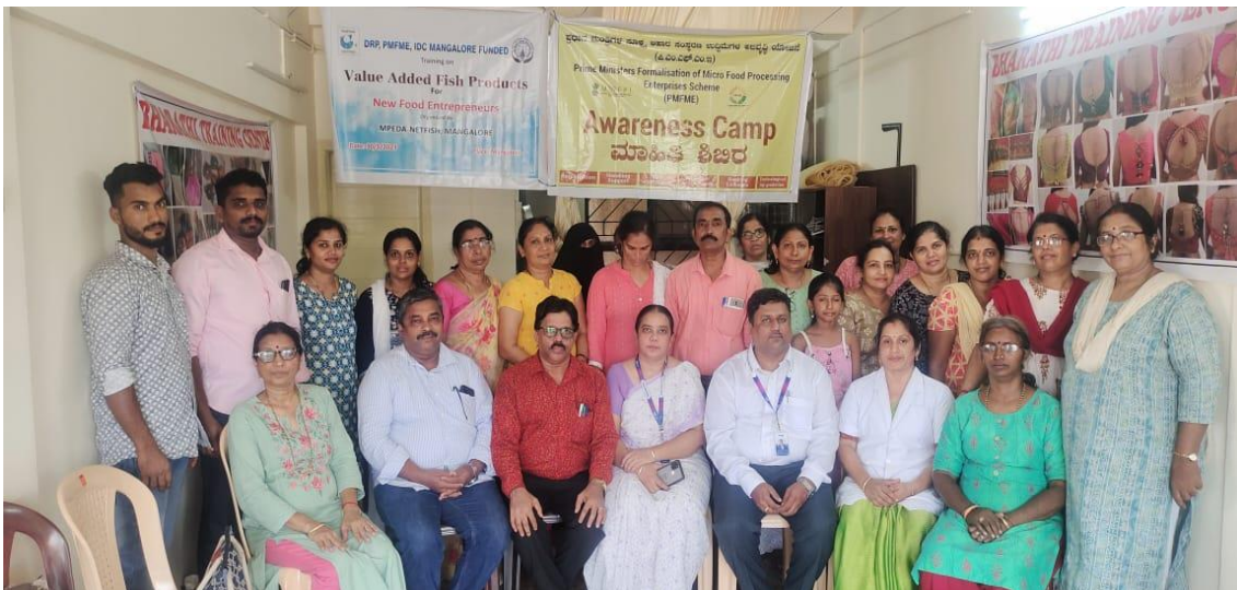
Value addition training programme sponsored by DRP, PMFME, Mangalore