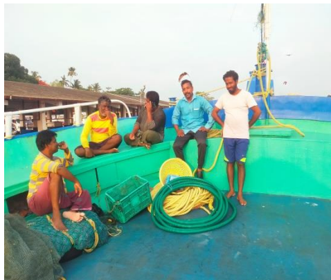
Awareness by HDCs