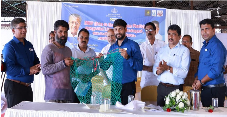
Distribution of plastic collection Bag to the fishers