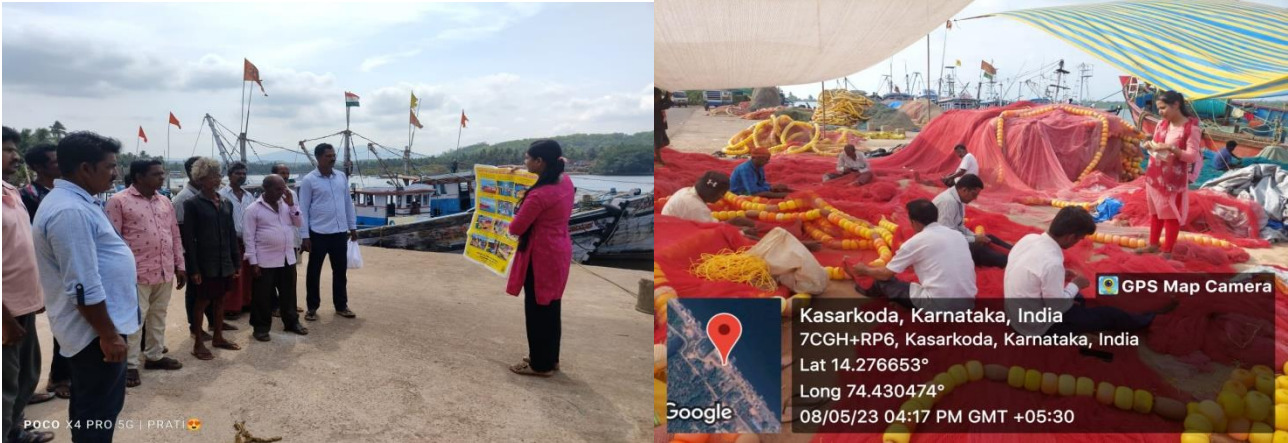
Awareness programs conducted by HDCs